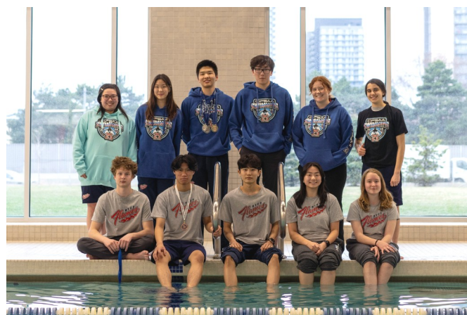
Not photographed—Aaron Tao

Prelims - placed 1 st | seeded 1:12.56, finished 1:11.98 Finals - placed 2 nd out of 63 | finished 1:10.74 * Silver Medal